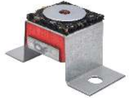
BAF IZODT 02 (TAVAN) BAF IZODT 02 (CEILING)